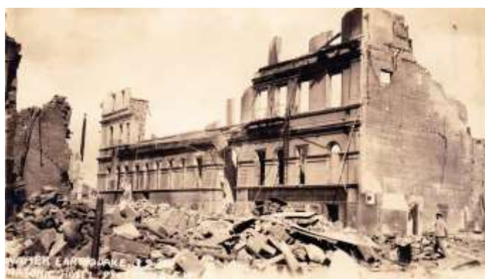
Napier earthquake 1931 - 256 deaths and most buildings destroyed.

Tropical Cyclone Gabrielle was surely predictive to a point, and surely on the East Coast of the North Island some rough weather was possible the way Gabrielle was tracking. That was the time to pre-plan, work out simplex frequencies, HF, VHF and UHF if need be, and to plan with hams outside of your area in case things happen with power and communications and the need to relay.