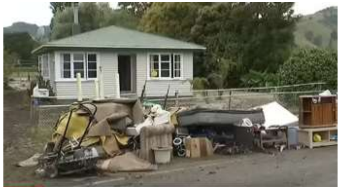
Silt and water damaged property piled outside a Te Karaka residence

A second civil defence centre on the other side of the township helped up to 300 evacuees but as no radio link existed for this centre, he was unable to provide messaging for this group until water levels dropped a couple of days later.