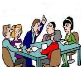
Minutes of Franklin Amateur Radio Club (Inc) Committee Meeting held at the clubhouse, Stadium Drive, Pukekohe 2 May 2023