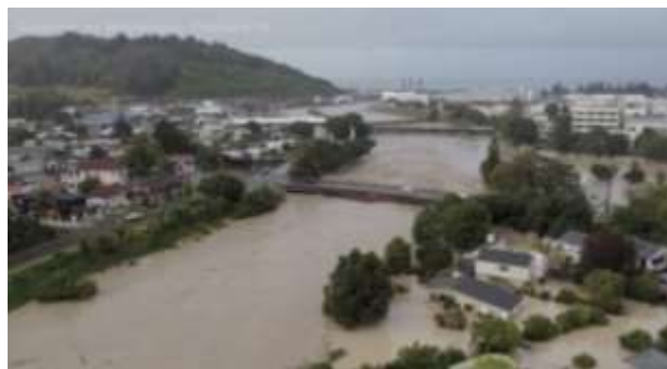
Gisborne under threat - February 15, 2023

Roger Sewing ZL2RC found himself isolated within Gisborne as Cyclone Gabrielle passed through. Internet and power were gone and did not return fully for up to a fortnight. Roger was fortunate to have a few solar panels, a 24V 450AH (rather ageing) battery bank and a 1200VA 240V inverter, to run his ham station, lights, TV if needed, and other smaller sundry items. He also possessed a second backup rig, an Atlas 210X rig in a suitcase, with tuner, aerial and cable bits, DC lead with battery clips, spare bits, a complete set-up, minus the power source. He had used Covid lockdown time to make sure the Altas worked and sure enough when his main rig failed he was able to move to backup within a few minutes. Being just outside Gisborne, his town water supply failed but luckily a home water tank remained full.