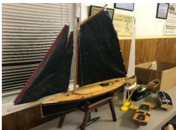
A selection of boats Maurie has built and sailed in recent times.

degrees centigrade. At any other temperature, paints are likely to run or form unsightly clots. As some boats can take months to complete, it is understandable such care is needed on the paintwork or the boat may be ruined.